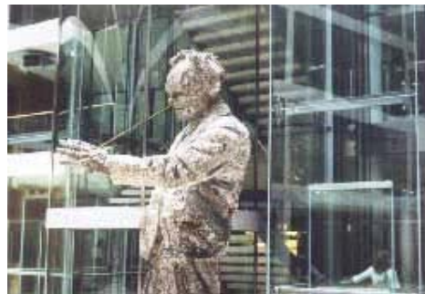
Willy Brandt sculpture in the foyer of the Social Democratic Party headquarters in Berlin-Kreuzberg.