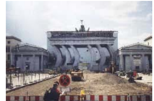
The Brandenburg Gate undergoing renovations 2002