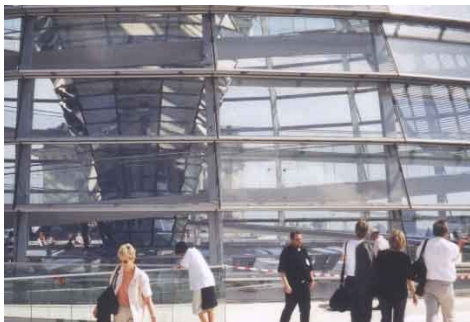
The new dome of the Bundestag, Germany's parliament, on top of the old Reichstag building