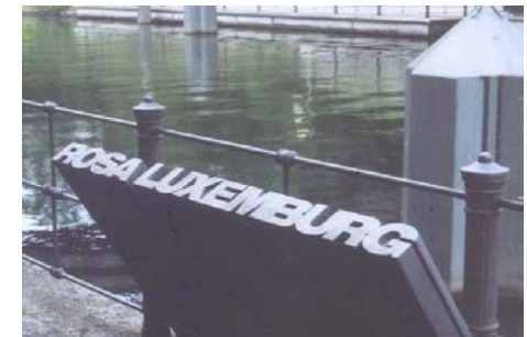
Memorial at the site of Rosa Luxemburg's murder in Tiergarten.